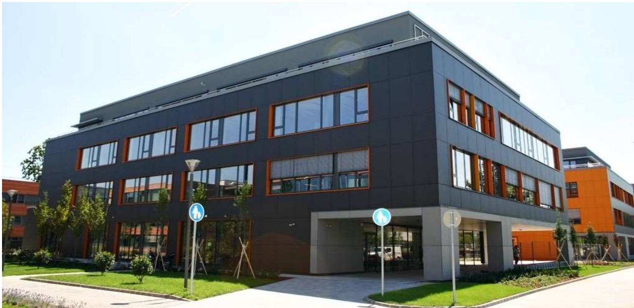
South Park (Architect: RADIUS B+S Stúdió)

26.4 million euros occurred until the end of the first half of 2018 out of the planned total cost of this development phase; tenants moving into the new complex contributed additional cca. 3 million euros to the implementation of their individual requests. Due to the current capacity shortages in the building industry and growing prices, 5-10% cost increase is expected till the finalization of the development in the southern development area.